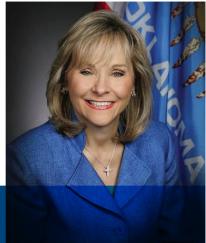
Governor Mary Fallin R-Oklahoma

It's exciting to hear these programs are already making a difference — our challenge going forward is to encourage more schools to be part of this. We need to replicate great programs like this throughout the whole state of Oklahoma to help transform education and our workforce,” Gov. Mary Fallin said as AP results from NMSI's Initiative for Military Families were announced in Oklahoma City.