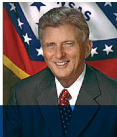
Governor Mike Beebe D-Arkansas

It's amazing what has been done with AP here,” Governor Mike Beebe told AP students at El Dorado High School. “You have taken this school and this state to new heights.” The Arkansas governor said students in NMSI's program “knock the socks off” AP exams and set the pace for the state in 2011-12.