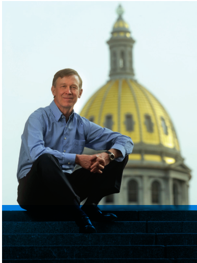
Governor John Hickenlooper D-Colorado

The Colorado Legacy Schools program teaches students the skills they need to excel in college. By incorporating high schools that serve military bases in our state, this program is helping to ensure students of military families are challenged with rigorous, college-level coursework regardless of where their families are called to serve,” Gov. Hickenlooper said as new AP results were announced for the Initiative for Military Family program in Colorado, which is administered for NMSI by Colorado Legacy.