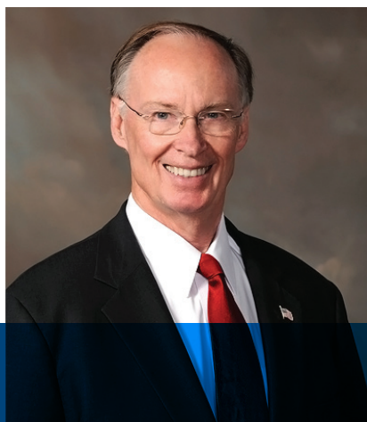
Governor Robert Bentley R-Alabama

I wish I would have had this when I was in high school,” Gov. Robert Bentley said as he joined the celebration of AP scores for 2011-12. The Alabama governor praised the AP program for helping state students prepare for college and helping their parents save money if their children earned college credit.